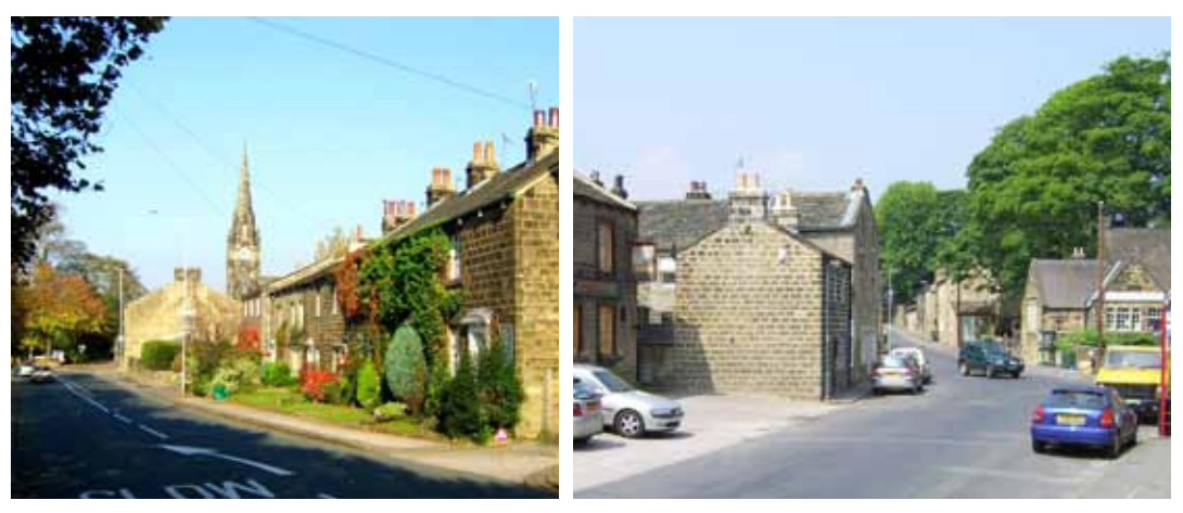
Main Street, Burley in Wharfedale

4.3.3 Within Wharfedale Burley in Wharfedale and Menston are both desirable locations and have both seen good quality housing developments supported by shops and community facilities. The two settlements have witnessed improvements to the environmental quality of the railway stations and continue to benefit from high quality, fast and frequent rail and bus services to Ilkley and the major city centres of Bradford and Leeds.